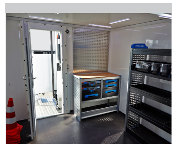
Workshop interior (optional)