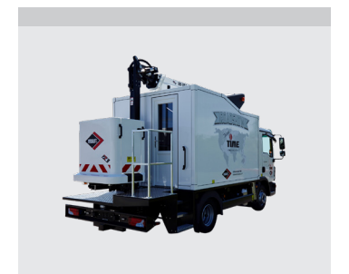
Workshop module for the chassis (optional)

Load cell (Variable load dependant outreach) Home function & limited working area without outriggers