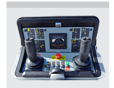
FPC (Full Proportional CANbus controls): Variable outreach (with load cell) and up to 4 actions at a time