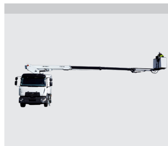
Turret/knuckle tail swing and outriggers within the mirrors