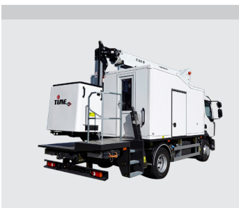
Workshop module for the chassis (optional)