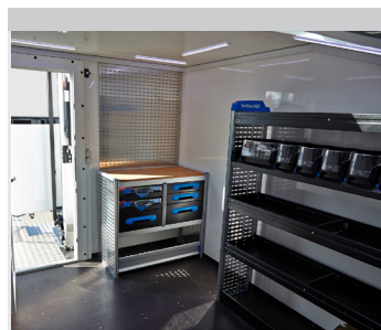
Workshop interior (optional)