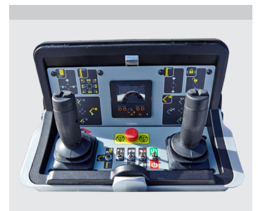
FPC (Full Proportional CANbus controls): Up to 4 simultaneous actions (2 per joystick)